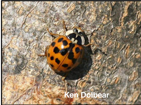
H. axyridis f. succinea