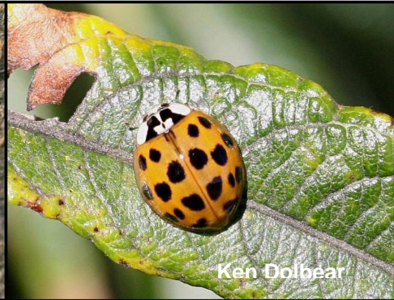
H. axyridis f. succinea