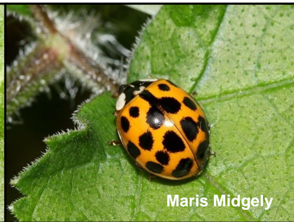
H. axyridis f. succinea