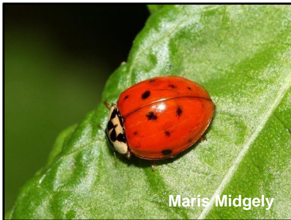
H. axyridis f. succinea